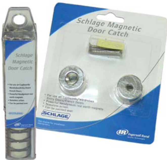
Available in Single SDC18504 or 5 Pair Vis Pack SDC18505